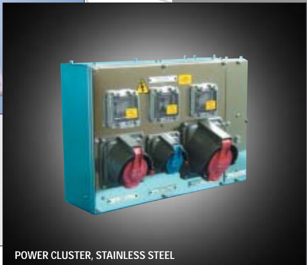
POWER CLUSTER, STAINLESS STEEL

Power Clusters are socket assemblies that have a single, glanded supply but multiple outgoing socket outlets of different voltages. All Isolators, MCBs, RCDs, Transformers, etc., are integral within the Power Cluster enclosure. The assembly is supplied to site fully wired and tested, enabling quick and efficient installation.