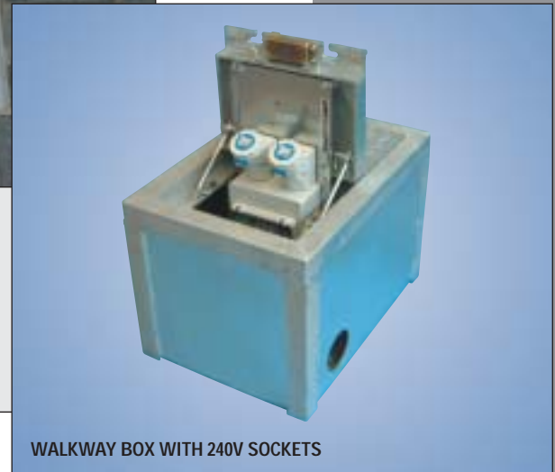
WALKWAY BOX WITH 240V SOCKETS

Walkway Distribution Assemblies have been developed for installation in Pedestrian Precincts and Car Parks where power is required to supply market stalls and other temporary or portable loads. The heavy duty hinged lid is closed in normal operation and presents no trip hazard to the public.