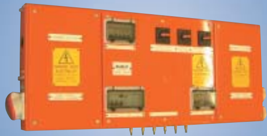
ASSEMBLY FOR PERMANENT TUNNEL APPLICATION

ProPower products are widely used in the following industrial sectors: Airports, Defence, Docks & Harbours, Electricity Generation & Supply, Food Processing, Local Authorities, Nuclear, Paper, Pharmaceuticals, Rail, Steel, Telecom and Water.