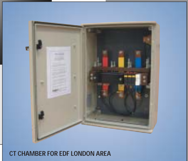
CT CHAMBER FOR EDF LONDON AREA

A range of CT Chambers from 400A to 2000A, in all insulated or steel enclosures, developed to meet the requirements of the different metering organisations in the UK. Combined CT Chambers and high current RCDs are available for Temporary Builders Supplies.