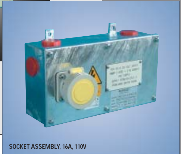
SOCKET ASSEMBLY, 16A, 110V

Socket assemblies normally incorporate sockets to BS EN 60309-2, which are available in current ratings from 16A to 125A and in voltages from 24V to 750V. We are able to supply assemblies with multiple outlets of different voltages with or without fuse, MCB or RCD protection.