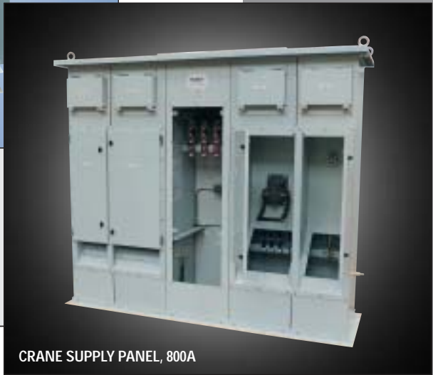
CRANE SUPPLY PANEL, 800A

A range of distribution assemblies from 100A to 3000A rating, for such diverse applications as: Ship to Shore Supplies, Refrigerated Containers, Crane Supplies, Tunnel Power & Lighting and any other outdoor application that requires a fixed source of power.