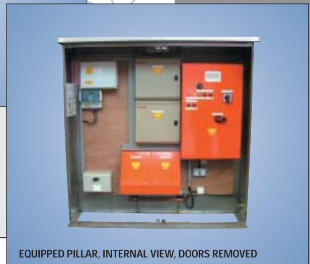
EQUIPPED PILLAR, INTERNAL VIEW, DOORS REMOVED

We offer a standard range of outdoor Pillar enclosures, fabricated from mild steel or stainless steel. Pillars can be supplied as empty enclosures or equipped with controlgear and switchgear as required. Non-standard enclosures can be supplied to meet special customer requirements.