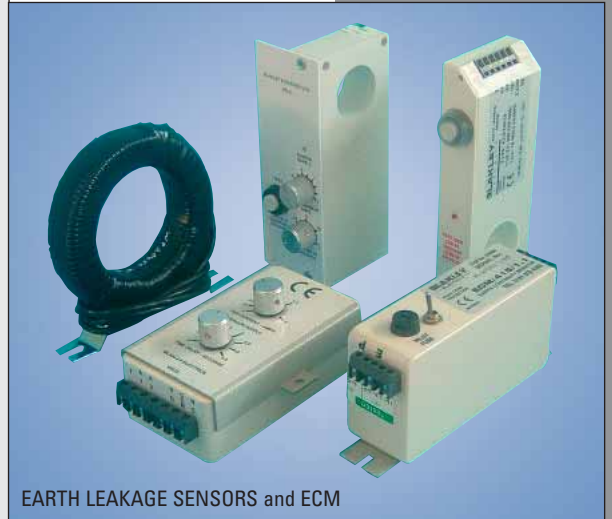
EARTH LEAKAGE SENSORS and ECM

If you have a requirement for RCD or Monitored Earth protection, please contact our Customer Service Centres who will be delighted to be of assistance.