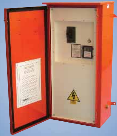
STEEL CASED RCD, 400A, TP&N

For hostile environments such as Shipyards, Steelworks and Quarries, we design and manufacture specialist assemblies incorporating RCD and / or Monitored Earth protection from 16A to 630A, with hard wired outputs or multi-pin sockets.