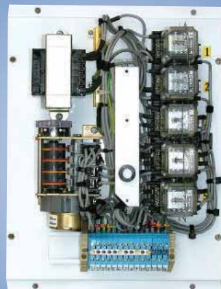
SENSOR IN SPECIAL ASSEMBLY

RCD Sensors, with sensitivities from 5 mA to 5A, work in combination with MCBs, MCCBs and Contactors and are ideal for incorporation within Switchboards, MCCs and other assemblies. Earth Continuity Monitors are also available for Monitored Earth and Electrical Interlocking applications.