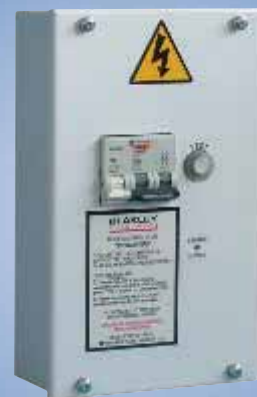
ENCLOSED RCD,DC IMMUNE

Widely used in "Third Rail" areas, Blakley sensor based RCDs are classified as "DC Immune" by Network Rail and are widely used for 230V and 110V applications. Safelink series RCD and Monitored Earth Protected Sockets provide supplies for train cleaning and maintenance.