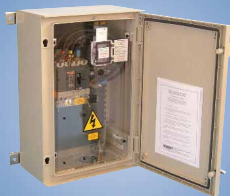
RCD, 200A, 4P ALL INSULATED

High current, outdoor RCDs in steel or all-insulated enclosures rated at up to 1250A with variable time and sensitivity settings. Safelink series af RCD and Monitored Earth Protected Sockets to feed pumps, welding sets, etc.