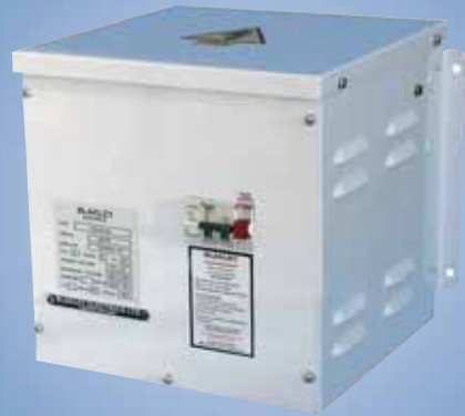
SAFE SUPPLY UNIT

From Safe Supply Units and Variable Laboratory Supply Units for Science Laboratories to RCDs with Emergency Stop facility for Workshops, we have a well established range of RCD protection assemblies developed for the Education sector, with sensitivities as high as 1.25mA.