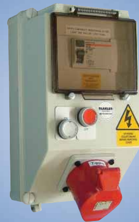
RCD/ME PROTECTED SOCKET

Standard products include: Safelink series of RCD and Monitored Earth Protected Sockets; High current RCDs rated at up to 1250A with variable sensitivity; Extra high sensitivity RCDs (to 5 mA) for areas of high risk. Custom assemblies can be developed for special applications.