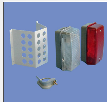
Standard Bulkheads, BC, Metal Body Polycarbonate cover

A 110V Emergency bulkhead with integral 3 hour Maintained battery pack. All insulated construction with Clear polycarbonate cover.