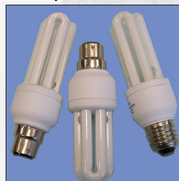
Compact Fluorescent Lamp, 13W, 110V BC - Fits Standard Bulkhead (ES CFL also available)