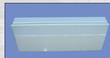
Emergency Bulkhead, 8W 110V, 3 hour Maintained

Please contact us to discuss the range of options that we have for controlling the supply to bulkheads, to avoid consumption 24 hours a day .