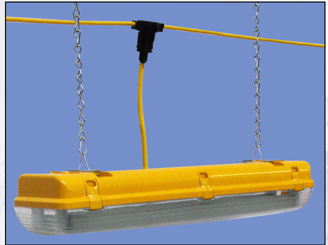
Flori-2X Fitting plugged-in to a Flori-2X outlet

Once the Floristoon cable and fittings have been hung, electrical connection is made simply by inserting and twisting the unique 3 pin Flori-2X adaptor into a moulded-on Flori-2X outlet. As Floristoon-2X utilises 3C cable only, circuits with emergency fittings should be permanently energised to avoid damaging tubes and battery packs through repetitive discharging. Where there is a routine requirement to switch off emergency fittings, please refer to our new Flori-67/4P system, which incorporates 4 core cable with 4 pin connectors, enabling an unswitched supply to be provided for the emergency pack.