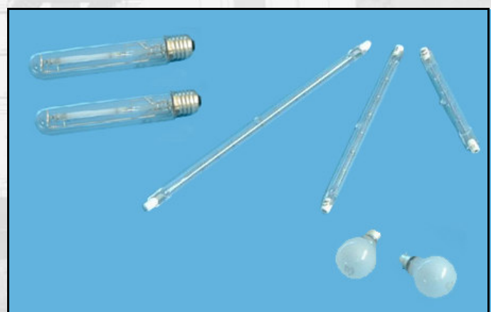
Metal Halide, GLS and Tungsten Halogen Lamps