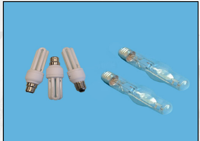
HPS and CFL Lamps