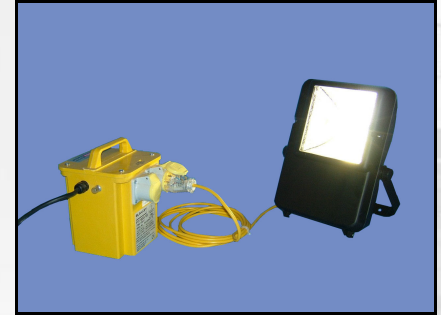
150W 110V Pre-wired Metal Halide Fitting S060679 (transformer supplied separately)