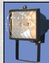
← 500W TH Fitting - Part S060122