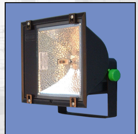
400W 230V Metal Halide Fitting Part S060187