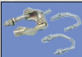
← Scaffold Brackets Half Swivel Part S060189 Pole Clamp Part S060190