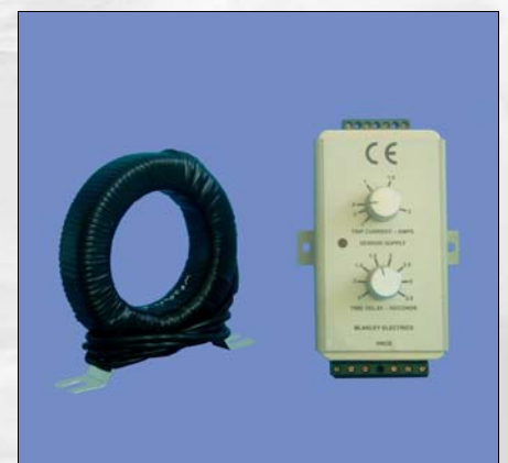
VRCD and 65mm ID CT