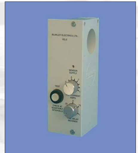
VELS with Optional Test Button Plate