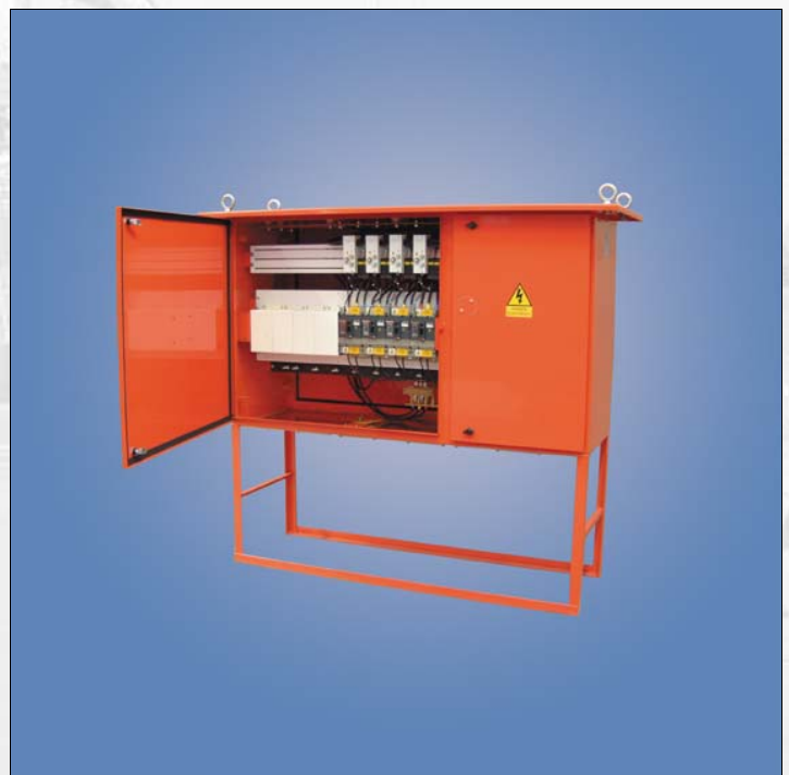
Image of a typical B6 Mains Distribution Assembly