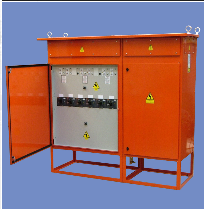
B7 MDA with low ground clearance (to stand over a trench)