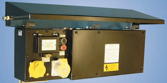
TUNNEL POWER TRANSFORMER 6 kVA THREE-PHASE

For temporary and permanent installation including: 1000:400V Step-up and Step-down pairs; Booster Transformers; 110V Power & Lighting transformers with socket outlets, MCB and RCD protection.