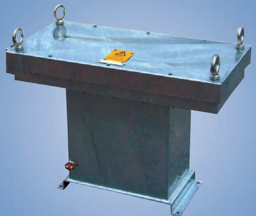
SPECIAL TRACKSIDE ENCLOSURE

For Points Heating, Step-up / down pairs, Isolation, Signalling, Power and Lighting. Supplied in high IP rating enclosures, galvanized or stainless steel; petroleum jelly filled when required. Various items approved by Network Rail and LUL.