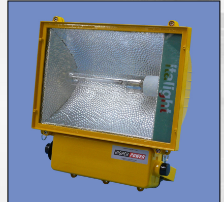
400W 110V MH Floodlights

Battery producer registration number: BPRN01915 EEE producer registration number: WEE/HC0061TU (Recycling scheme is administered by Electrolink)