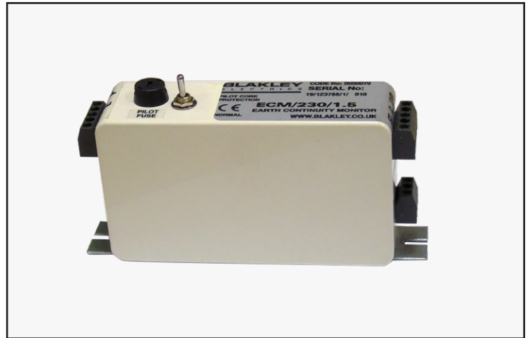
Type ECM/230/1.5 - 230V, 1.5 ohms