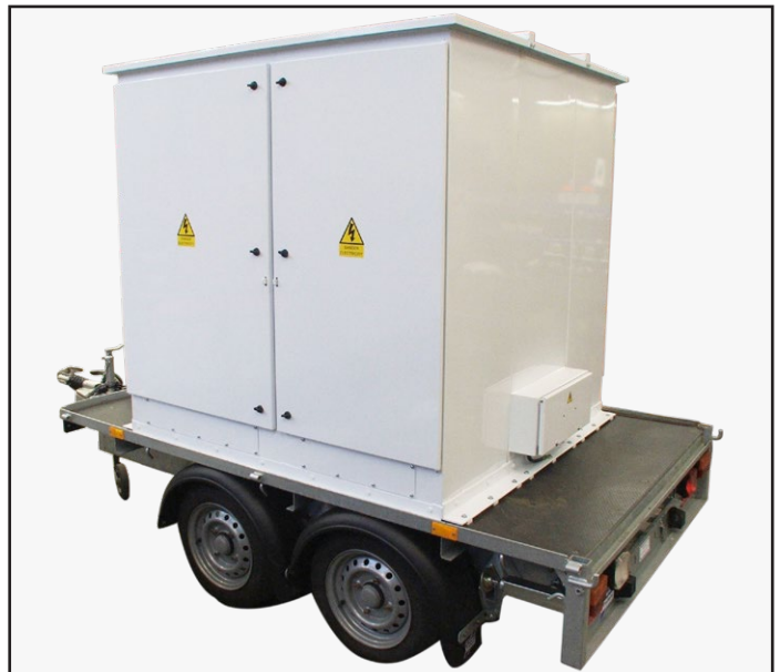
Distribution assembly mounted on road trailer