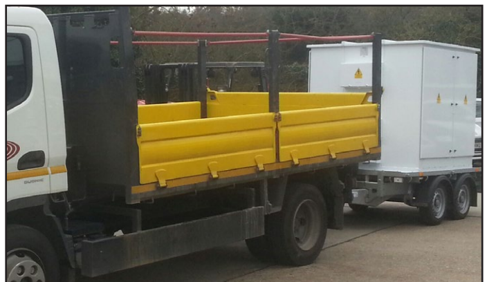
Road trailer hitched to vehicle