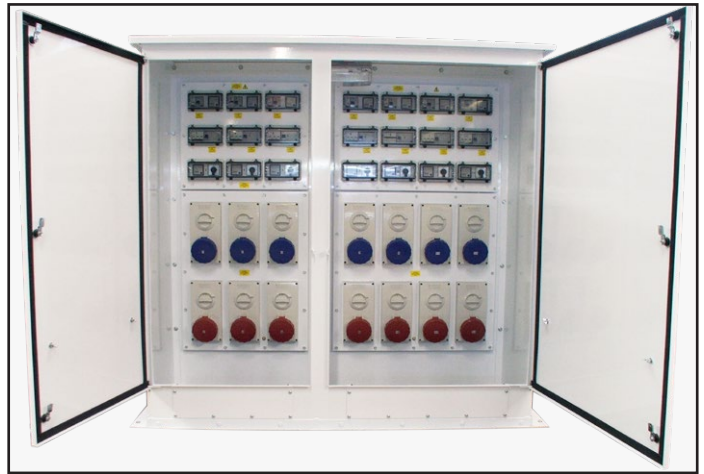
Distribution compartment c/w 7 x 230V & 7 x 400V interlocked sockets

If you have a requirement for trailer mounted distribution assemblies please contact the Blakley Projects Team.