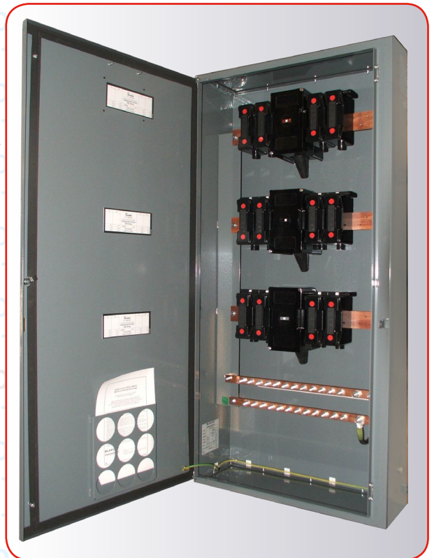
FB series wall mounting fuse board for a Sellafield permanent installation

If you have a requirement for heavy duty distribution boards incorporating BS88 fusegear, for installation at Sellafield or elsewhere, please contact our Crayford or Wakefield Customer Service Centres.