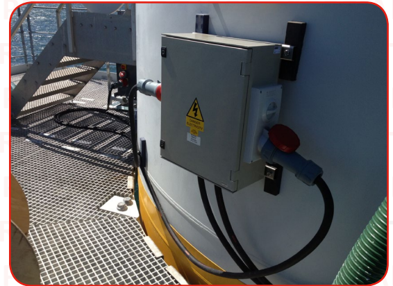
Fixed Assembly, 400 / 415V

Please see over the page for drawings of the main assemblies and how they interconnect.