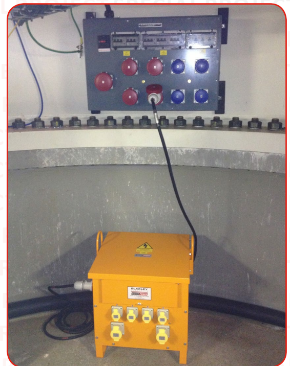
Power Cluster feeding a 10kVA Transformer