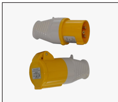
Plugs & Couplers, 16A, 110V, IP44