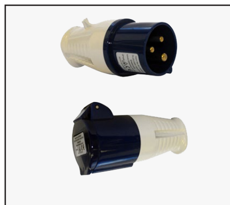
Plugs & Couplers, 16A, 230V, IP44