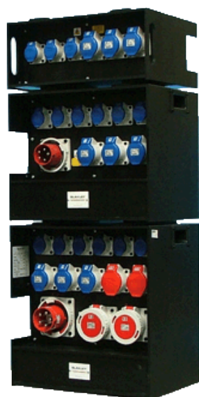
IDA series all-insulated assemblies, 125A & 63A