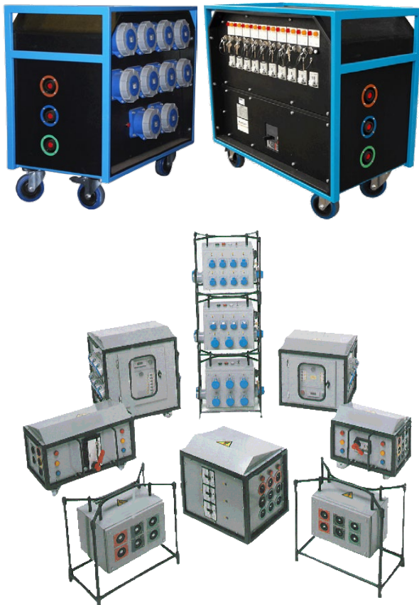
Custom Assemblies for Film Lighting

Many of these products are shown on our website and detailed on product data sheet ref. DDS200.