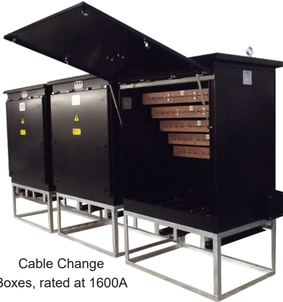
Cable Change Boxes, rated at 1600A