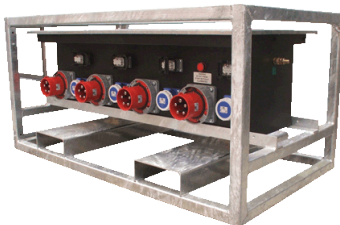
GIU with 4 x 125A incomers, individually interlocked to ensure inlet pins are not live until mated with a connector

Our range of AMF panels extends from 125A to 3200A and assemblies are generally presented in steel enclosures mounted within crash frames. Contactors are used on assemblies rated up to 800A and ACBs are used for higher current ratings. All changeover devices are mechanically and electrically interlocked.