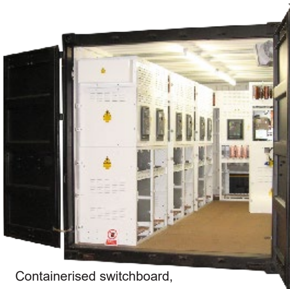
Containerised switchboard, rated at 7400A

Power requirements have increased dramatically in recent years, which has seen the current rating of primary distribution assemblies increase accordingly. To meet this demand, we have produced distribution assemblies with bus bar systems rated up to 7400A, incorporating switchgear rated up to 6300A. Cable termination arrangements can be particularly challenging at the top end of the range and have included the requirement to terminate up to forty-eight 300mm 2 single core cables per ACB.