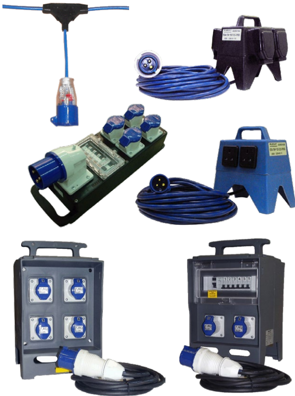
Stock 230V assemblies

To complement our high and medium current distribution products, we offer a range of 230V final distribution assemblies and other accessories.