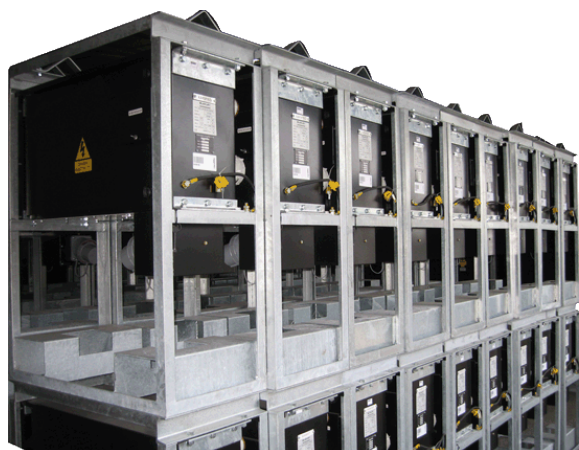
250A Distribution Assemblies in crash frames