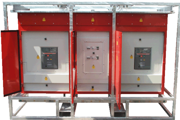
AMF assembly, 3200A

The use of Automatic Mains Failure (AMF) panels at large events is commonplace. Although AMF panels do not guarantee an uninterrupted supply, they should ensure that an event is only without power for a few minutes rather than a few hours.