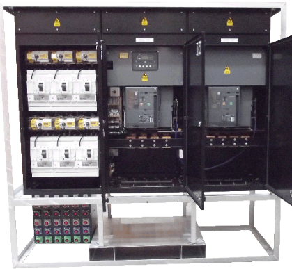
Combined 2000A AMF & distribution assembly