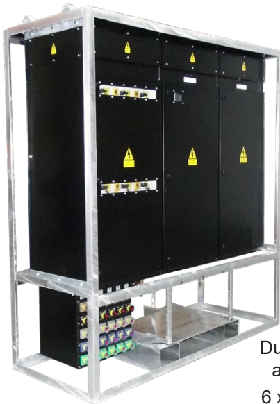
Dual input 2000A assembly with 6 x 400A outputs