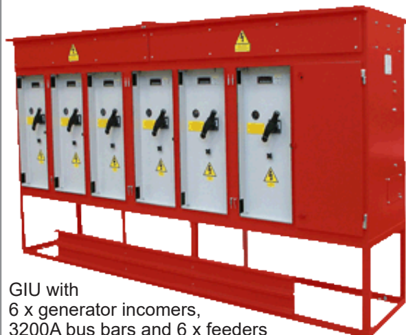
GIU with 6 x generator incomers, 3200A bus bars and 6 x feeders

Generator Interface Units (GIUs) can be used to achieve two main objectives, as outlined below.