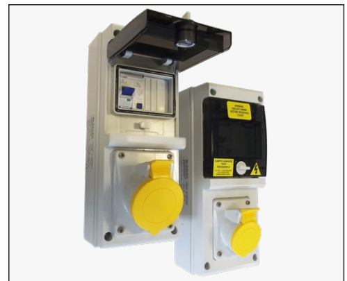
16A and 32A, 110V, 2P+E, IP44, Surface Sockets with 30mA RCD protection