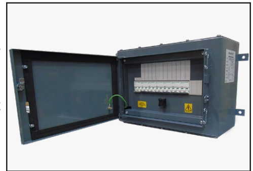
Part S040392, MCB Board, 110V, fitted with a 100A incoming isolator and 6 no. 16A DP Type "C" MCBs