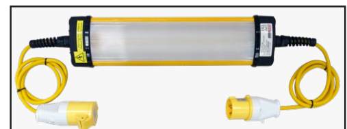
Part No. S061099: SlimLight fitted with 7m input and output leads, complete with 16A 2P+E 110V plug and coupler