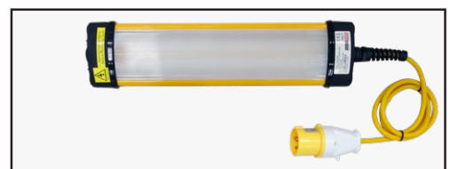
Part No. S061098: SlimLight complete with 5m cable complete with 16A plug