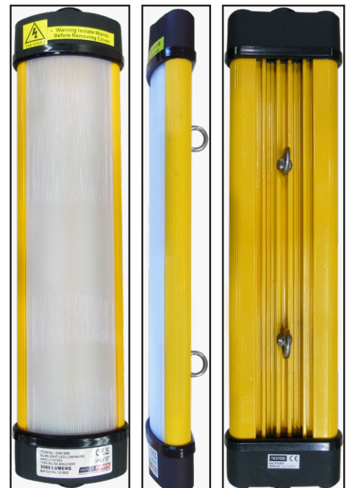
Part No. S061069 SlimLight (unwired), showing front, side and rear views.